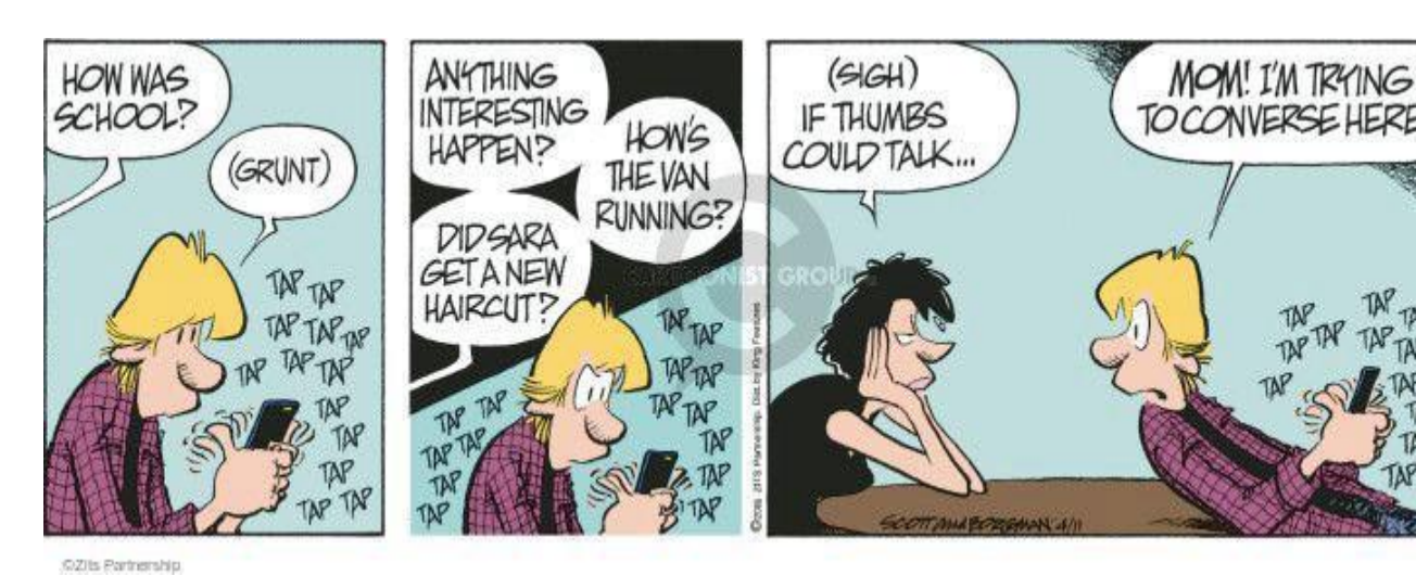
*Note: Does this sound familiar to you?

Prerequisite: PSY 1013 Introductory Psychology, 3 credit hours