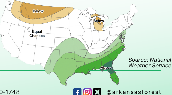
Figure 3. Seasonal Precipitation Outlook

National data provided by the U.S. Bureau of Labor Statistics showed that the PPI decreased 3.7 percent for logging and 1 percent for trucking from September 2022 to September 2023.