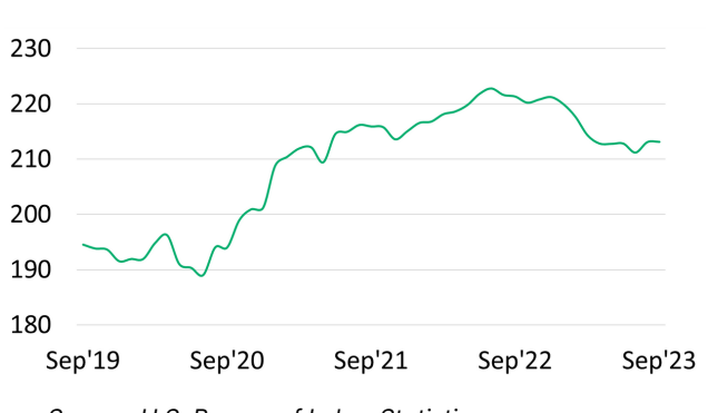
Figure 1. U.S. PPI logging trends

The Producers Price Index (PPI) measures the average change in the prices producers receive for their products. This index plays a key role in assessing inflation. When the PPI increases, it can be an indication that the cost of production is increasing.